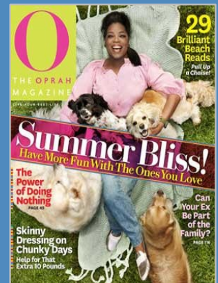
O Magazine July 2011