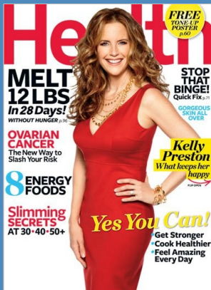
Health September 2011