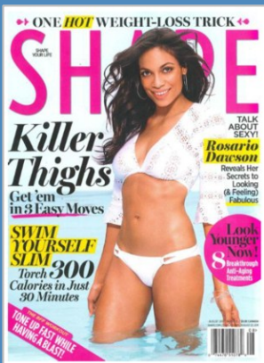
Shape August 2011