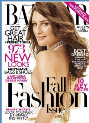
Harper's Bazaar September 2011