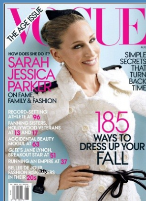
Vogue August 2011