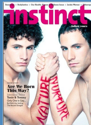
Instinct August 2011