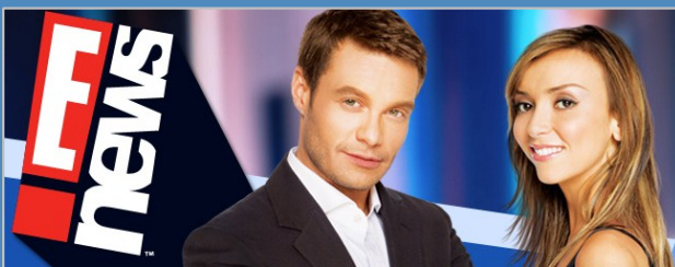
E! News August 2011